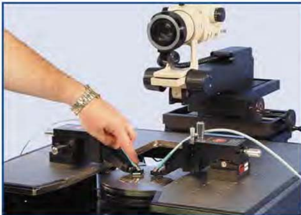
The tilt-back microscope provides unobstructed fixturing access.