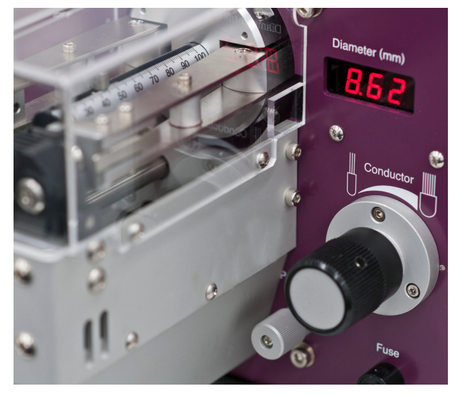
▲ Analogous controls for intuitive operation